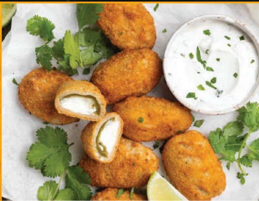
FROZEN JALAPENO POPPERS