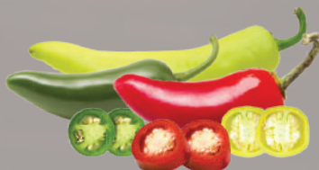
Whole / Sliced Peppers