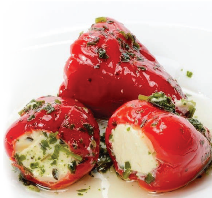
STUFFED NOSA DECANO