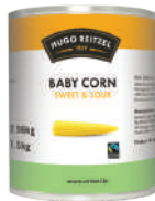
Can 425g, 1.5kg, 2.1kg