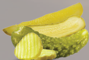
Whole / Sliced Gherkin